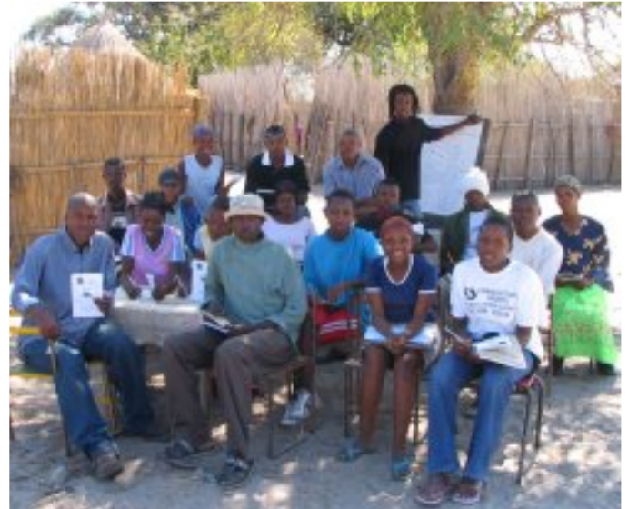
Some of the students and their teacher at the workshop

how life used to be. We are now working on plans for the next workshop, thinking of ways to build on what went well this time, and ways to improve areas that are weak.