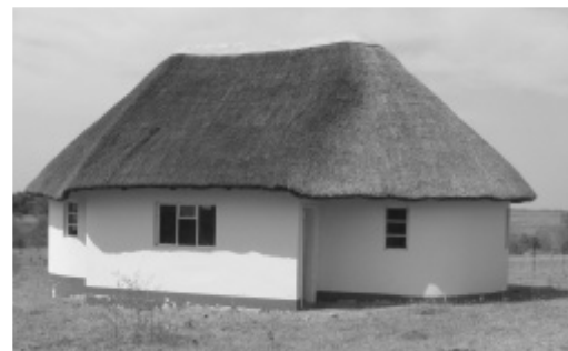
The office at Ngarange

We have been doing all the transcribing of the stories on the other side of the river in the village of